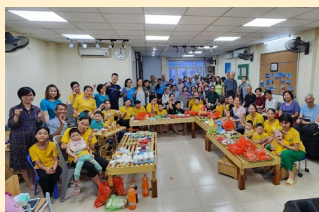
Pic. 2 Dac Thang Community Health Care Centre