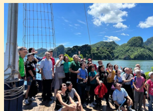
Pic. 8-10 Various memorable moments on the trip!