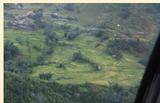
Pic. 6 View from Cable Car