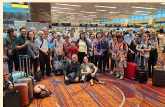
Pic. 1 The team at Changi Airport