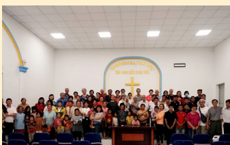
Pic. 4 Church at Sapa