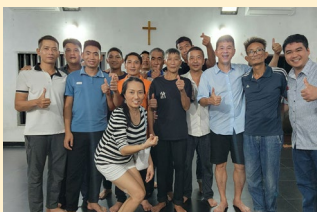
Pic. 3 Drug Centre