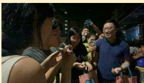
Fellowship over Jollibee & Balut, quintessential Filipino dishes 🍽️