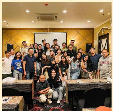
Worship Workshop 4-6 Sep 2023