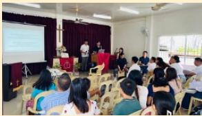
3 Sep 2023, at the Liloan church