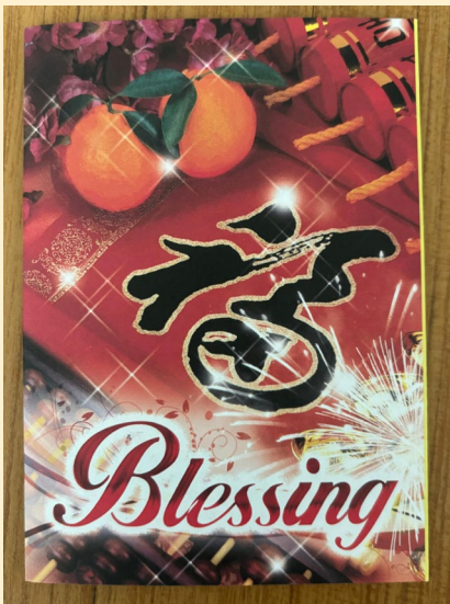
▲ 'Blessing' Gospel Tract

May we share this message as we convey blessings at Lunar New Year.